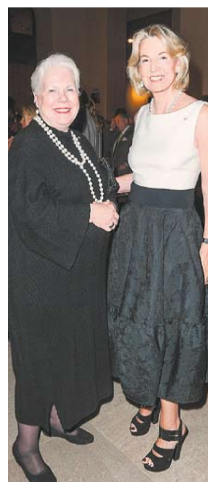
Hon. Elizabeth Dowdeswell, Hon. Hilary M. Weston ●