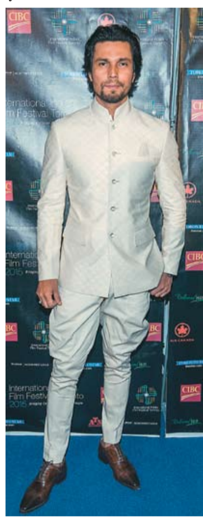
Randeep Hooda ●